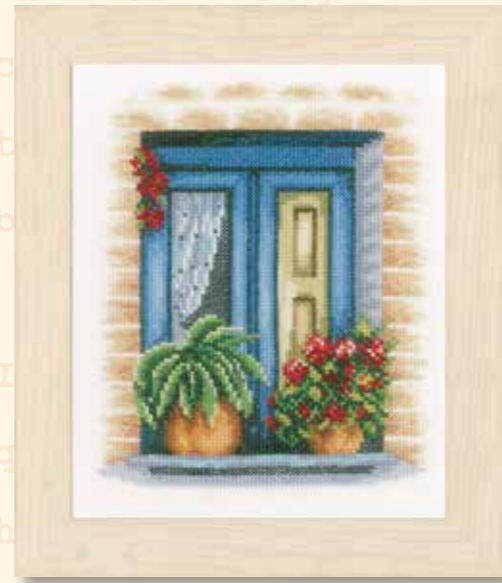
PN-0167121 K 18 x 21 cm