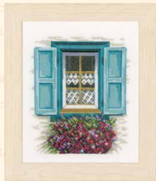
PN-0167123 K 18 x 21 cm