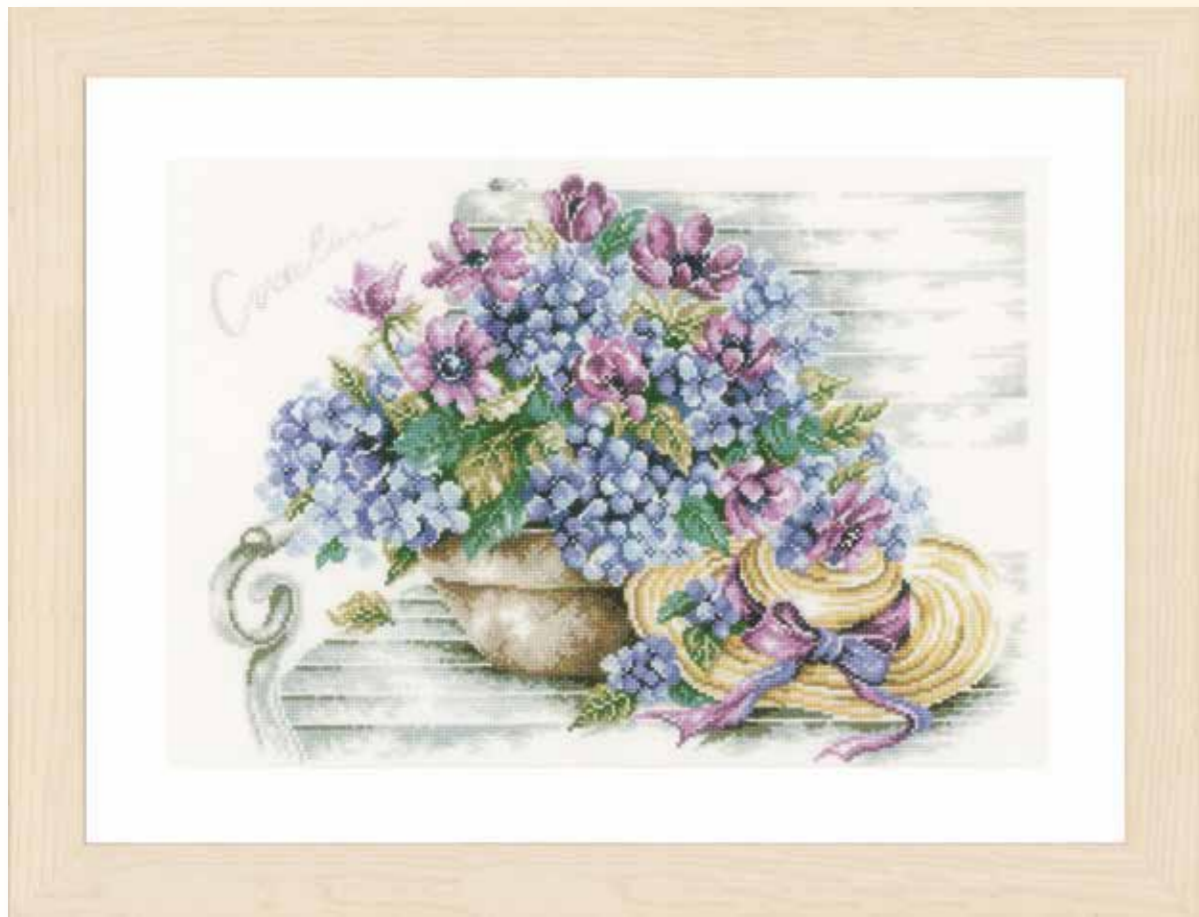
PN-0167812 S 44x34 cm