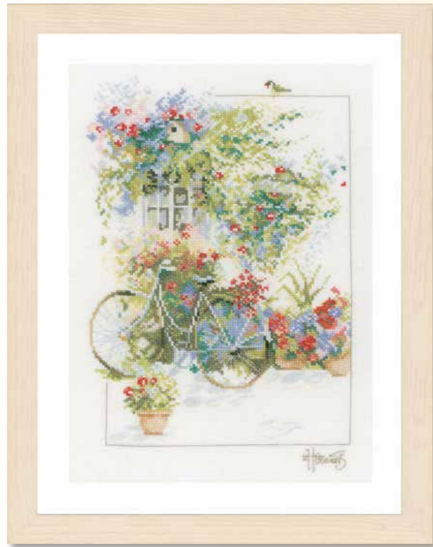
PN-0168447 K 29 x 39 cm