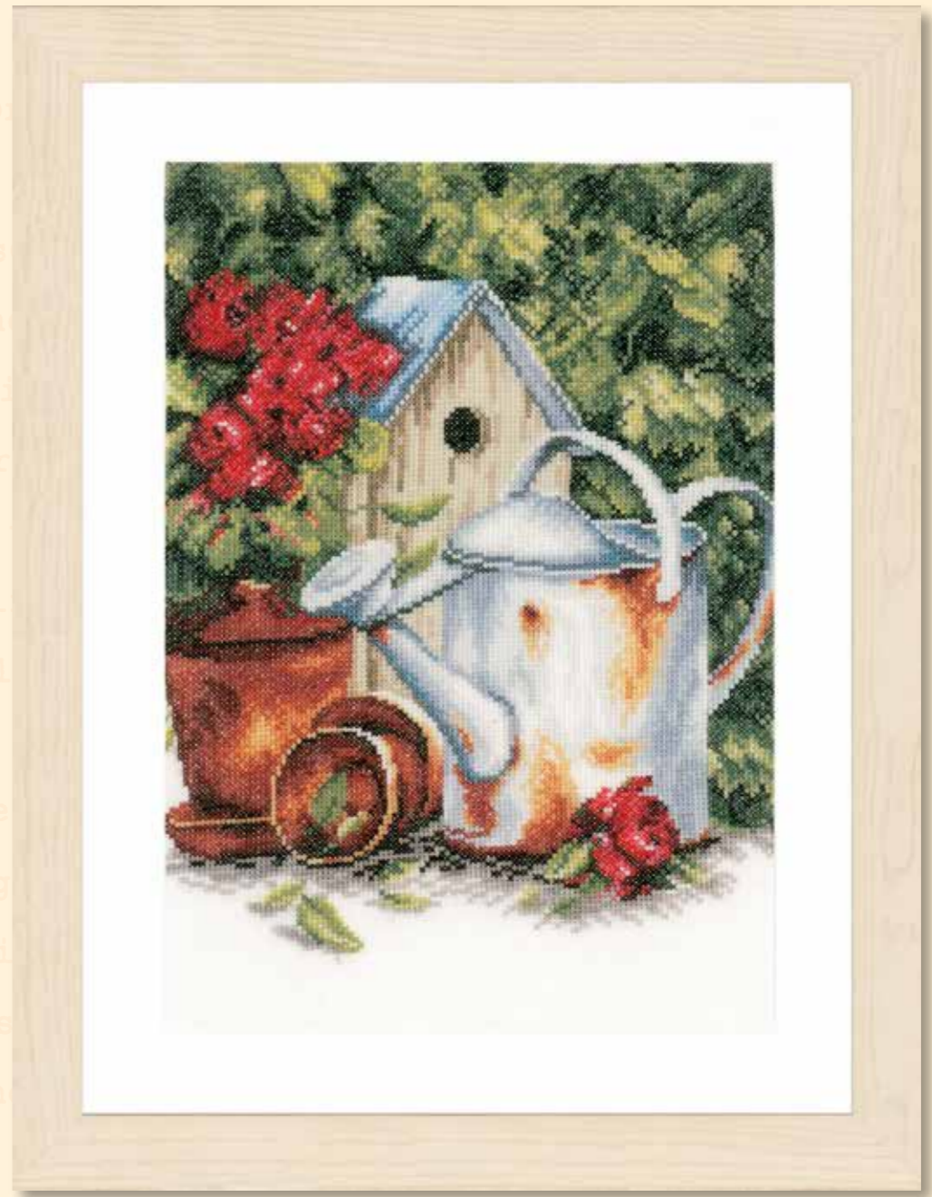
PN-0167124 P 20 x 26 cm