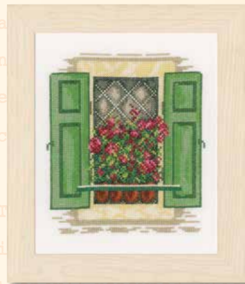
PN-0167122 K 18 x 21 cm